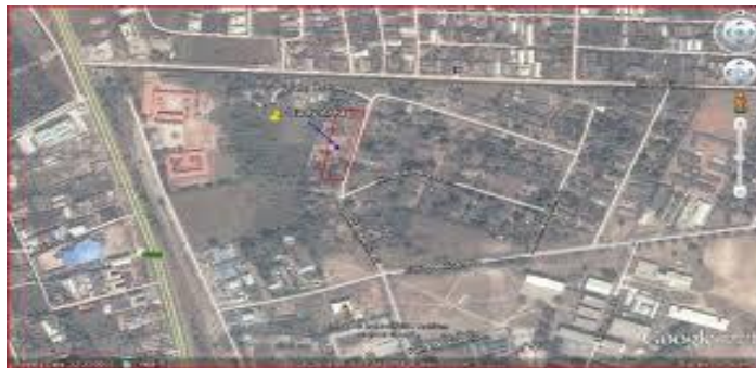
Figure 1: Campus Map Showing Selected Deployment Location and Gateway Position

LoRa communication was evaluated in an open laboratory corridor using a transmitter-receiver pair separated by 50 meters with intermittent obstructions. The node transmitted 1,000 packets at 10-minute intervals with a spreading factor of 10 and 125 kHz bandwidth. The gateway recorded an average RSSI of 78 dBm and a packet delivery ratio of 98.7%, with losses attributed to transient electromagnetic interference from nearby equipment. These results established baseline reliability for short-range, line-of-sight operation.